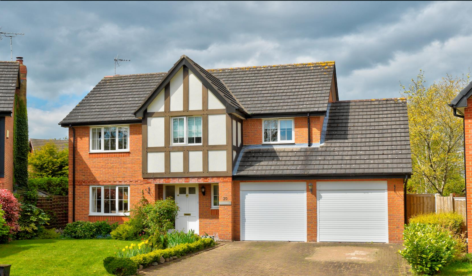
20 KENSINGTON DRIVE | WILLASTON | NANTWICH | CHESHIRE | CW5 7HL | OIRO £539,000